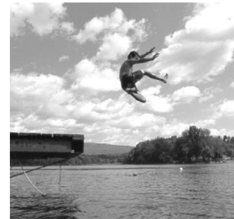
A leap of faith off the dock at Lake Paran.

Another place to cool off is in the Roaring Branch River , on Route 9, east of Bennington. Park along the highway (on the south side, or your right coming from Bennington), near where you see the sign for the National Forest. A series of informal trails lead to a number of shallow swimming holes along the river. River temperatures range from frigid in the early summer to